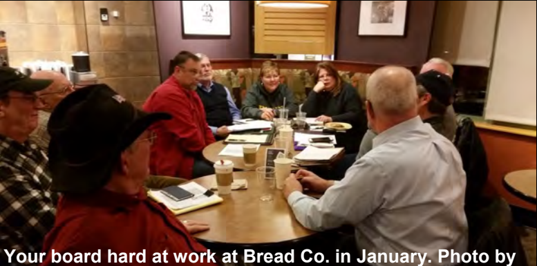
Your board hard at work at Bread Co. in January.